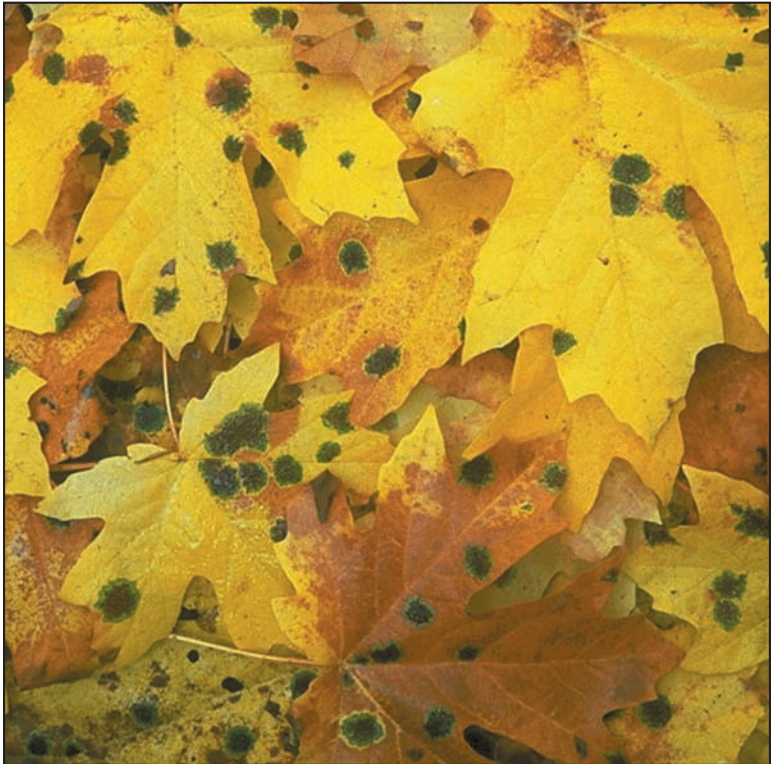
Mold growing on fallen leaves.

This document is available on the Environmental Protection Agency, Indoor Environments Division website at: www.epa.gov/mold