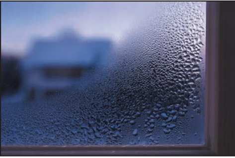
Condensation on the inside of a window-pane.