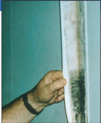
Mold growing on the back side of wallpaper.

Suspicion of hidden mold You may suspect hidden mold if a building smells moldy, but you cannot see the source, or if you know there has been water damage and residents are reporting health problems. Mold may be hidden in places such as the back side of dry wall, wallpaper, or paneling, the top side of ceiling tiles, the underside of carpets and pads, etc. Other possible locations of hidden mold include areas inside walls around pipes (with leaking or condensing pipes), the surface of walls behind furniture (where condensation forms), inside ductwork, and in roof materials above ceiling tiles (due to roof leaks or insufficient insulation).